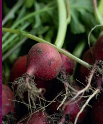
Grow Your Own Veg Strips 3 for £10 Mix & Match