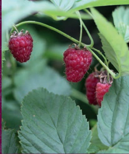
Fruit Bushes £4 each