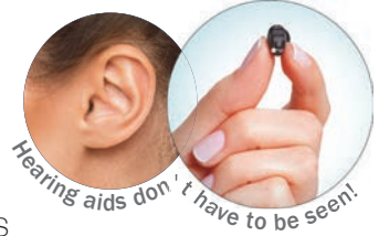
Hearing aids don't have to be seen!

HULL hearing CENTRE independent hearing aid audiologists