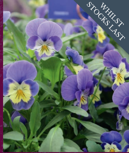
Pansies & Violas 8 for £5

Join our FREE exclusive Weber Event on Sunday 16th April for live cooking lessons and tasters!!!